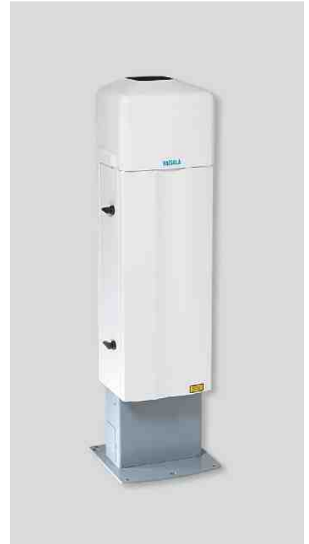
Vaisala Ceilometer CL31 measures cloud base height and vertical visibility in all weather - good or bad.

The CL31 is easy to install. It has a radiation shield that protects the unit during precipitation and against excessive heat or cooling in extreme temperatures. The automatic window blower with heater improves performance by keeping the window clean and dry. In cold conditions heating prevents frost generation on the window.